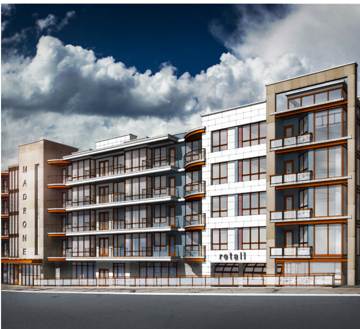
Madrone - Dallas, TX