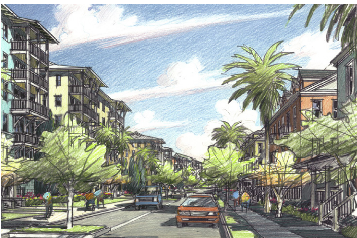
Schikendanz Brothers - Longwater Bay