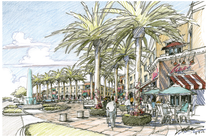
Stone Creek Properties – Town Centre at Los Banos Entry

When laying out a new community, our philosophy is based upon identifying and incorporating the unique natural attributes of the site to act as a central unifying element that can link the neighborhoods. Every site has a unique history and story to tell that can become an authentic design theme for key elements of the community, from entry monumentation to architectural theming and focal amenity areas that create the heart of every community.