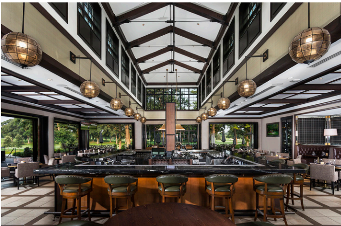
Butterfield Country Club