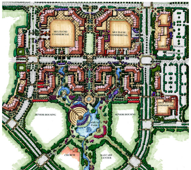
Stone Creek Properties - Town Centre at Los Banos Main