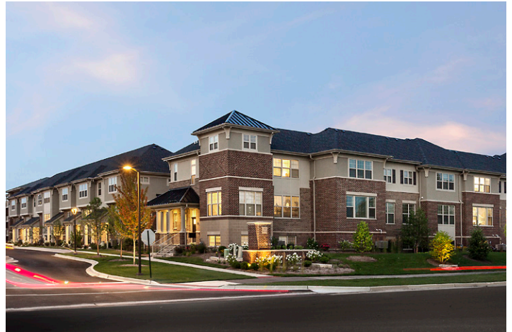
REVA Development – Deer Park Crossing

Our architects and land planners have extensive experience in creating and coordinating unique expressive architectural themes for communities and amenity buildings. They understand that creating consistent value and maximizing the exposure and premiums of both recreational and residential property within a community requires a special approach. As a result of the communication between our interdisciplinary teams, BSB Design's communities meld architecture, land planning and landscape architecture into cohesive, seamless design solutions that produce successful and exciting results.