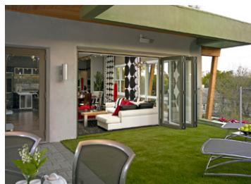
The New American Home® 2007

As evidence of our commitment and expertise, the firm was selected to design The New American Home® 2007 for the International Builders' Show in Orlando, Florida. A showcase of green technology, including a green roof with photovoltaic cells, 95% efficient storm-water management system, and energy efficient materials and appliances, the home marries high design and sustainability.