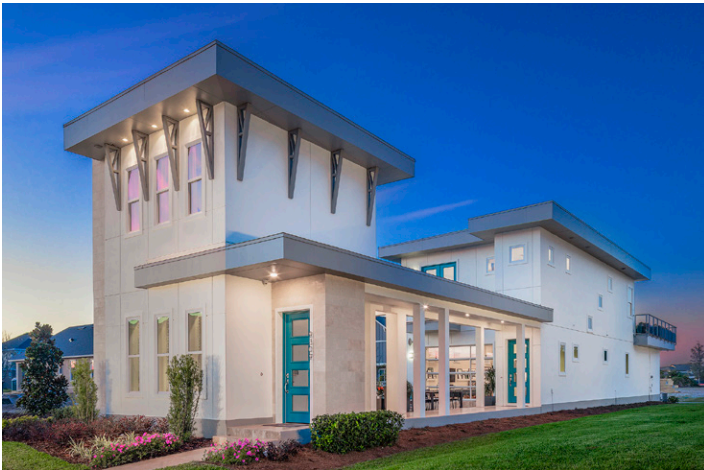
Craft Homes – Laureate Park