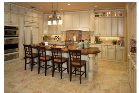
ICI Homes – The Emerald at Plantation Bay Golf & Country Club