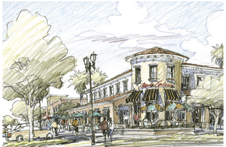
Stone Creek Properties – Town Centre at Los Banos Main Street