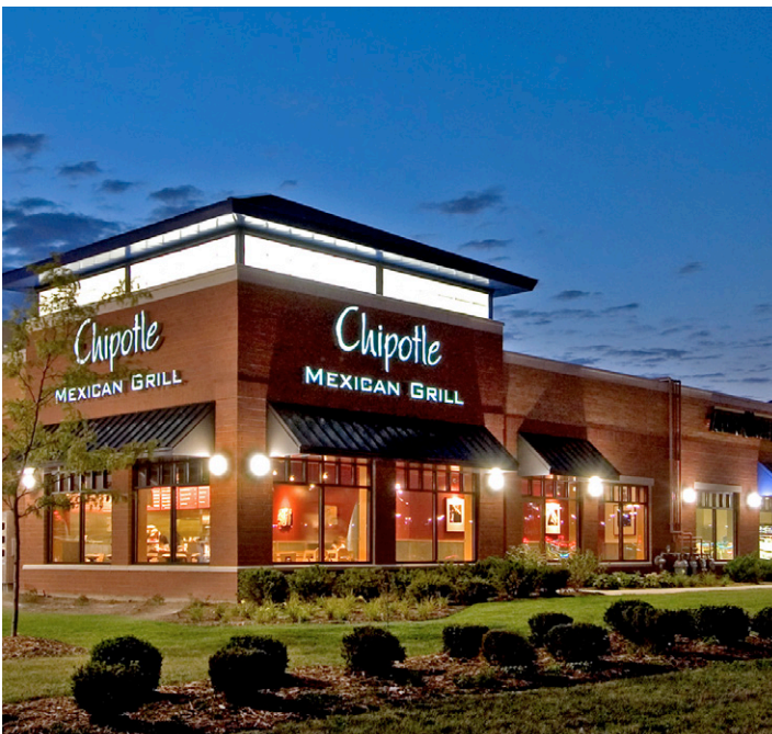
Lee Fry Companies – Route 59 & Liberty Street

BSB Design has developed a successful track record in virtually every residential housing type being designed and built today. Included are rental apartments, condos and townhomes for first time buyers, unique, custom homes for specific clients, conventional single family homes for today's families, upper end estate homes, infill housing for rebuilding downtown areas, and housing developed specifically for today's growing population of empty nesters and retirees. As the firm has grown, we have also expanded our expertise into more complex building types, including seniors housing, country club facilities, community clubhouses and activity centers, swimming pool complexes, midrise residential buildings, light commercial strip centers and residential scale office buildings. The firm and its staff continues to provide cost effective, market sensitive housing that retains a sense of interior style and street appeal that homeowners continue to enjoy.