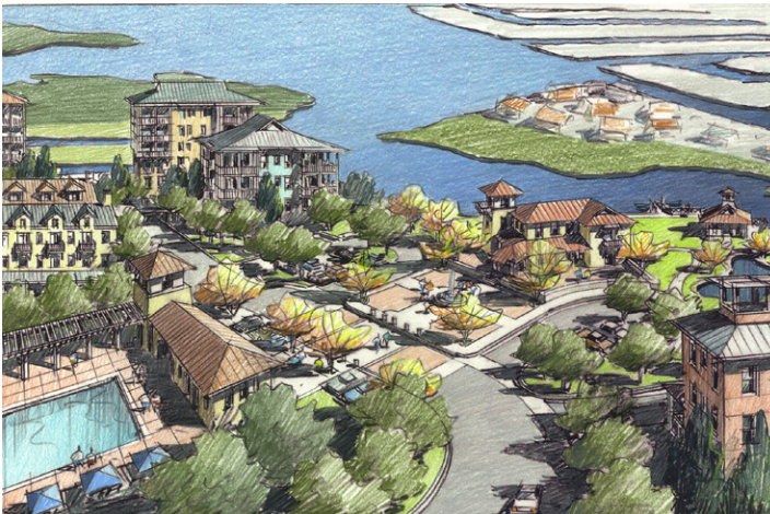
Schikendanz Brothers – Longwater Bay Recreation Center