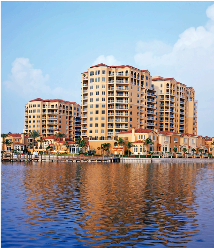
JMC Communities – Belle Harbor

As you review our design experience, please keep in mind the following proven attributes that BSB Design brings to the project team: