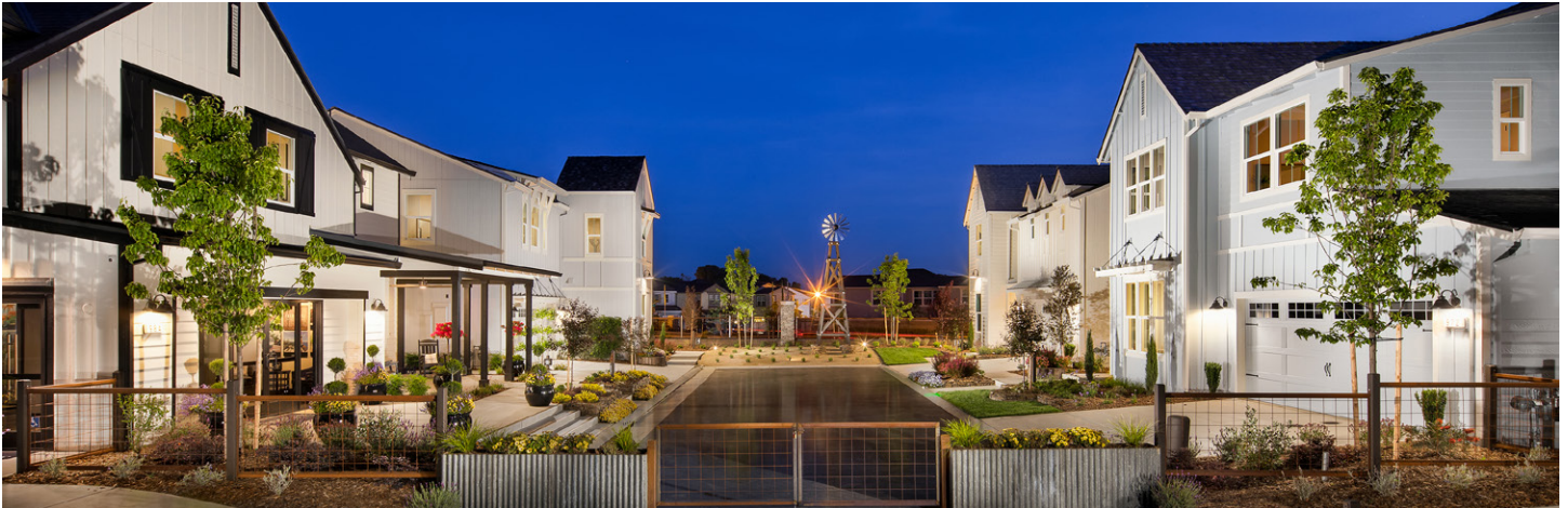
BlackPine Communities – Farmhouse at Willow Creek