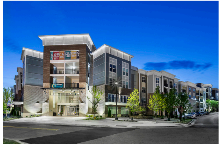
The Fortus Group – The Flats at Austin Landing

Through innovative methods of design and service, BSB Design has earned the reputation in the industry as a builder's architect, one who understands the importance of service and marketable designs. Over the years, the firm has developed unique services like design reviews, design consultations and CAD consultations to further assist builders and developers in need of quality design services in a compressed time frame. As a result, BSB Design's client list reads like a Who's Who of national builders, including 19 of the top 25 companies listed in the 2017 BUILDER Top 100. In addition, we continue to explore new markets by expanding into commercial, high rise, resort and international projects.