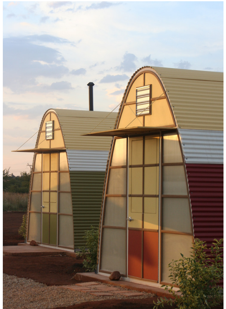
BSB Design – Abōd

Our goal is to provide quality design and functional plans within your budget and time constraints. We do this by maintaining two clear areas of focus. The first is subjective and deals with creativity. The second is a more objective process of step-by-step procedures. Depending upon your specific needs, our emphasis may shift from one focus to the other. In any case, the end result of our approach is a design that satisfies your aesthetic, functional and budgetary needs.