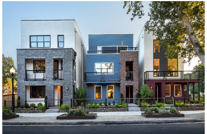
BlackPine Communities – The Creamery at Alkali Flat