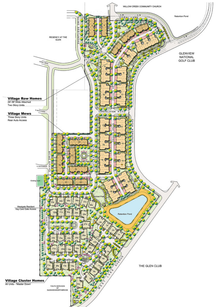
Edward R. James Homes – Westgate at the Glen