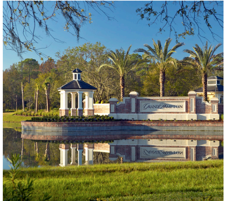
Landmar – Hampton Club at Grand Hampton Entry Feature

BSB Design's expansion into the global marketplace has strengthened our ability to provide market-driven design and marketable projects. From Canada to the Bahamas to the Pacific Rim, we've proven our ability to help developers create profitable projects – both domestically and internationally.